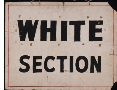
Sign: White Section, Municipal Auditorium, ca. 1950. Gift of the Cultural Center. 2000.044.6

The case Plessy v. Ferguson went before the U.S. Supreme Court in 1896. They upheld the Louisiana Supreme Court's decision, which discouraged future constitutional challenges to segregation laws. All southern states passed discriminatory racial segregation laws.