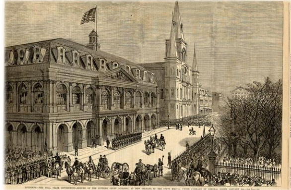
Louisiana the Dual State Government Seizure of the Supreme Court Building, at New Orleans by the State Militia, 1877. Frank Leslie's Illustrated Magazine. Illustration, news, wood engraving. 1982.112.06

In 1873, white residents opposed to racial integration and federal occupation during Reconstruction attacked the racially-integrated Metropolitan Police in Jackson Square. They attempted to take over the Cabildo and Arsenal, but failed. In 1874, a white supremacist militia called the Crescent City White League fought the Metropolitan Police in an armed conflict, known as the Battle of Liberty Place. Around thirty people died and many were injured. The White League occupied the Cabildo and the Arsenal until President Ulysses S. Grant sent federal troops to restore order. In 1876, after a disputed governor's race, a militia of three thousand white men captured the Cabildo. They overthrew the Metropolitan Police and occupied the Louisiana Supreme Court. Events on the national stage, including a contested presidential election, resulted in the removal of federal troops from Louisiana and effectively ended Reconstruction by 1877. This was followed by decades of racial segregation, the suppression of Black voters, and discrimination and violence against people of color.